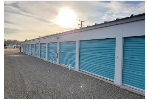
PRINCE GEORGE, BC