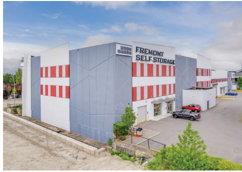
PORT COQUITLAM, BC